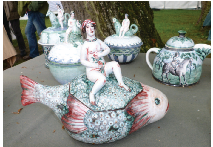
Pottery displayed at the International 'Topfermarkt' in Diessen am Ammersee provided a wide range of intriguing exhibits enjoyed by those visiting from Windermere.