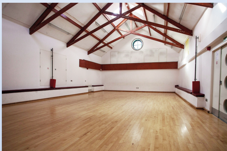
Photo showing activity hall at The Phoenix Centre.

Some of the current ideas involve projects working with local authors, musicians and chefs so we are certain that future editions of the HUB will contain some interesting news about future projects.